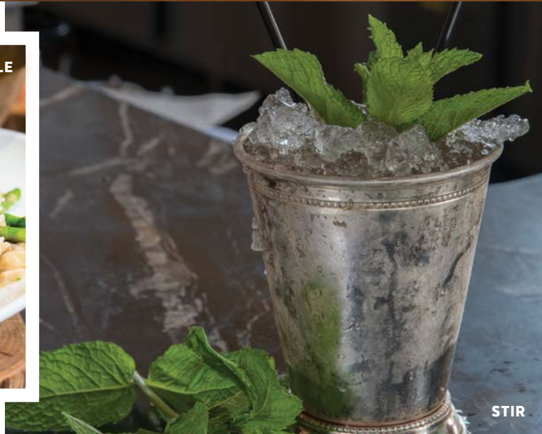
(TOP) PHOTO BY LANEWOOD STUDIO (LEFT) PHOTO BY RICH SMITH (RIGHT) PHOTO BY MED DEMENT