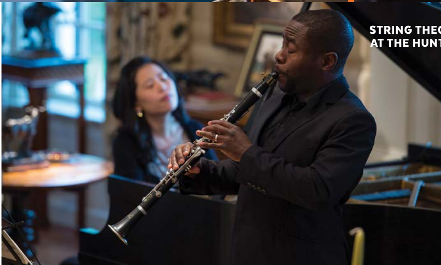
STRING THEORY AT THE HUNTER

Furthering Beauty, Creativity, Education, & Culture