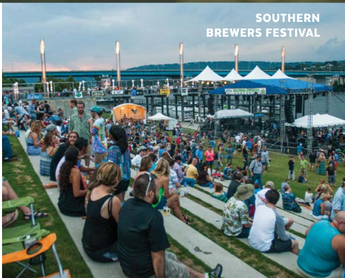
SOUTHERN BREWERS FESTIVAL