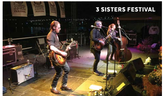
3 SISTERS FESTIVAL

(TOP) PHOTO COURTESY OF R&R MARKETING (LEFT) PHOTO FROM SOUTHERN BREWERS (BOTTOM) PHOTO FROM 3 SISTERS FESTIVAL