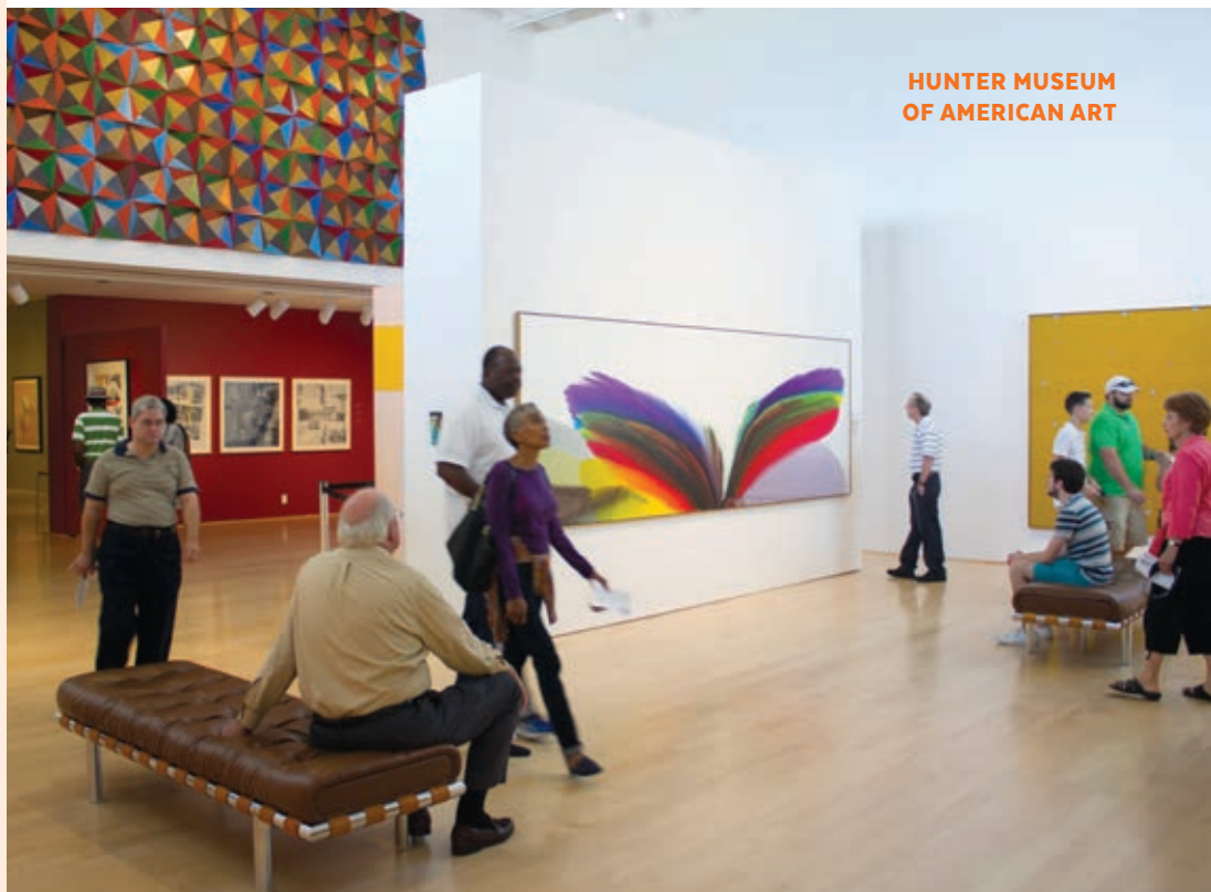
HUNTER MUSEUM OF AMERICAN ART

Bates Raintree Florist and Fine Arts Gallery 7235 E Brainerd Rd. Chattanooga, TN 37421 (423) 892-6112 batesflorist.net