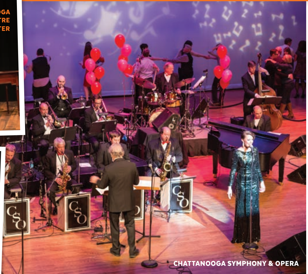
CHATTANOOGA SYMPHONY &amp; OPERA