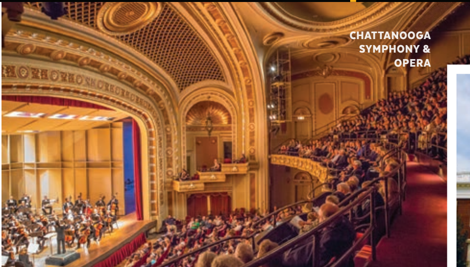
CHATTANOOGA SYMPHONY & OPERA

Igniting creativity, challenging minds, building communities