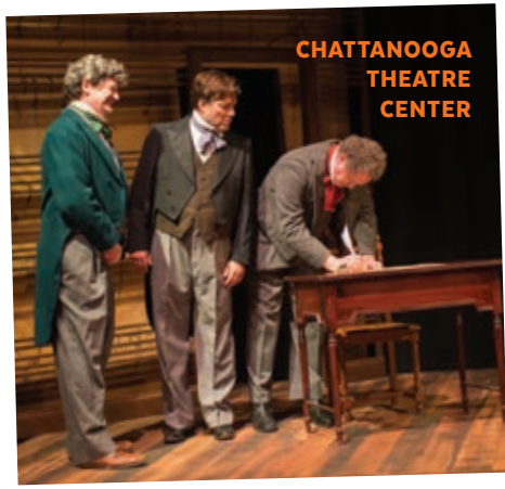
CHATTANOOGA THEATRE CENTER